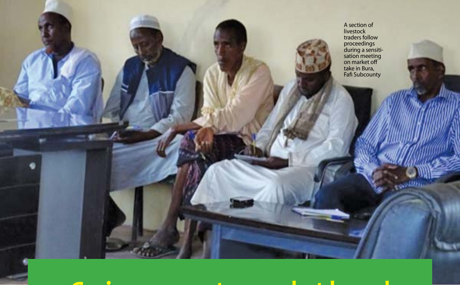
A section of livestock traders follow proceedings during a sensitisation meeting on market off take in Bura, Fafi Subcounty