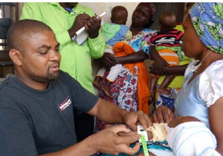
Health workers screen children under the age of five years at Mbuluni Primary School in Ndavaya Ward

The exercise integrates screening, provision of supplements and immunisation. Cases that require farther attention are referred to health facilities.