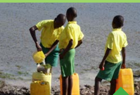
A pupil filters water from Jila dam in Ganze, Kilifi County. NDMA is distributing water treatment tablets as part of ongoing drought response interventions.