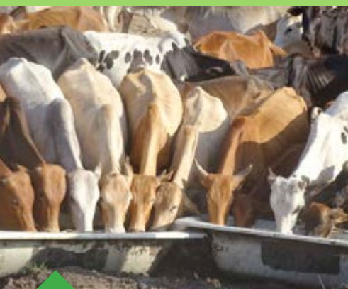
Livestock water at Rongama water pan in Rorogi Village, Puma Ward in Kinango Subcounty of Kwale on October 19, 2016.